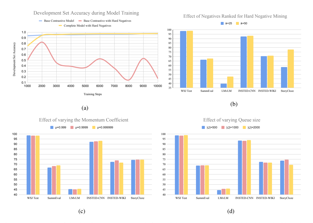
Figure 2: (a) A plot of the development accuracy during training our contrastive model with and without hard negative mining, and our complete model with hard negative mining. The accuracies are evaluated after every 1000 gradient steps. (b) Results on the various test sets for our model trained with hard negative mining by sampling different number of negatives (h) for ranking. (c) Results on the various test sets for our complete model trained with different momentum coefficient ( \mu ) values. (d) Results on the various test sets for our model trained with different global queue Q sizes. Please note that the agreement values for LMvLM test set have been scaled by a factor of 100 to facilitate visualization in figures (b), (c) and (d).

most prior work (Elsner and Charniak, 2011; Moon et al., 2019). We now test the effectiveness of other datasets, by varying the task itself and by using a different dataset for the permuted document task.