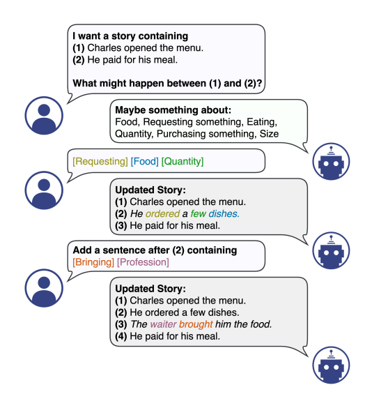
Figure 1: The proposed generation model, applied to the interactive story generation task. Similar to the existing infilling models, a user can insert or rewrite text spans at any position in a story. With the proposed extension, generation can be guided via explicit frame semantic constraints, either provided manually or suggested by the model based on surrounding context.

In Frame Semantics (Fillmore, 1976; Fillmore and Baker, 2010), words evoke structural situation types (frames) that describe the common schematic relationships between lexical items. We hypothesize that these structured types can be used to effectively induce the semantic content of text generated by increasingly powerful pretrained language models, yielding a flexible, controllable and domaingeneral model for surface realization of story plans with a variety of dimensions for user guidance.