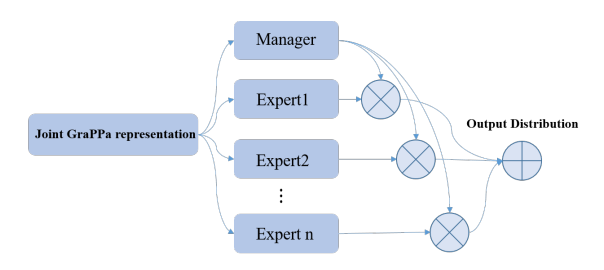
Figure 2: The structure of verifying model is based on the types of statements. An MLP manager activated by the softmax function takes the joint representation as input and outputs the probability distribution that the statement belongs to different types of statements. Multiple MLP experts process the joint representation and output the classification logits, which are further averaged by the statement type probability from the manager to achieve the final classification logits.

also has its advantages and will explain later. After encoding the table and statement by GraPPa, multiple networks are devised to do reasoning based on the encoded representations. The following sections provide further details of these models, named pruned-table-based models and whole-table-based models separately.