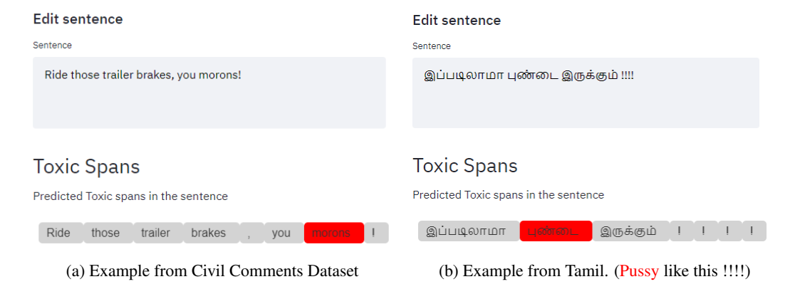
Figure 2: Examples in English and in a low-resource languages. The experiments were conducted with en-large and the multilingual-large models respectively.

an option from en-base, en-large, multilingual-base and multilingual-large. These models have been already downloaded from the HuggingFace model hub and they are loaded in to the random-access memory of the hosting computer.