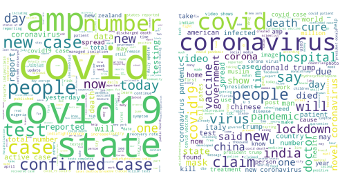
(a) Worcloud of Real Posts

The dataset comprises 10700 manually annotated samples and is split into (60%) train, (20%) validation and (20%) test sets. We provide the exact numbers for each split/class in Table 1 for clarity. The dataset is class-balanced as it contains 52.3% samples of real posts and 47.7% samples of fake posts. As an analysis on it, we obtained a word-cloud illustration for both real and fake samples and observed a high lexical overlap between both the classes, where words like 'coronavirus', 'covid19', 'people', 'cases', 'number', 'test', etc. are repeatedly used in both the sets. We do not show the word cloud due to space constraints. We create and present a wordcloud for the dataset in Figure 1.