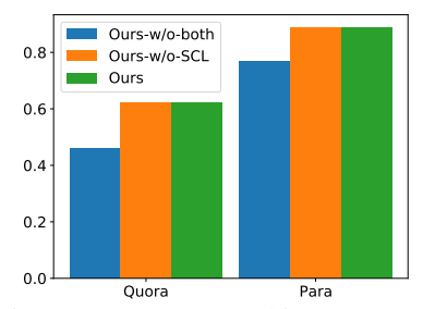
Figure 2: Content Matching Accuracy

Some examples generated by our model are shown in Table 4. It can be observed that our model can generally generate high-quality sentences which have similar style with the exemplar and retain the semantic meaning of the source sentence. More-