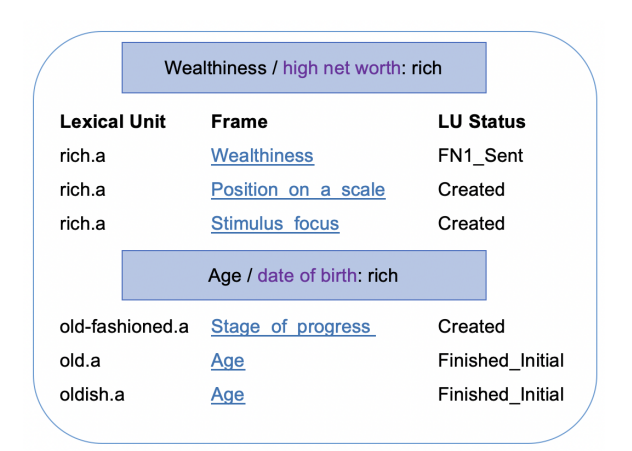
Figure 1: In FrameNet, adjectives are lexical units that evoke other frames: "rich" is a lexical unit that evokes the frame wealthiness, while "old" evokes age. The relation between rich and high net worth could be defined as a value-attribute pair, where rich is the value of an expression that represents an attribute: wealthiness/net worth . LU stands for lexical unit, FN1_Sent represents and Finished_Initial refer to which FrameNet version the lexical unit is from.

Given the ability of pretrained language models (PTLMs), such as BERT (Devlin et al., 2019), to create useful text representations, they have become the standard choice when building NLP applications (Peters et al., 2018a; Devlin et al., 2019; Radford and Narasimhan, 2018). However, there has recently been a rising amount of research that uses probes to understand the level of linguistics PTLMs encode. Different probing experiments have been proposed to study the drawbacks of PTLMs in areas such as the biomedical domain (Jin et al., 2019), syntax (Hewitt and Manning, 2019), semantic and syntactic sentence structures (Tenney et al., 2019; Peters et al., 2018b), prenomial anaphora (Sorodoc et al., 2020), linguistics (Belinkov et al., 2017; Clark et al., 2020; Tenney et al., 2019) and commonsense knowledge (Petroni et al., 2019; Davison et al., 2019; Talmor et al., 2020).