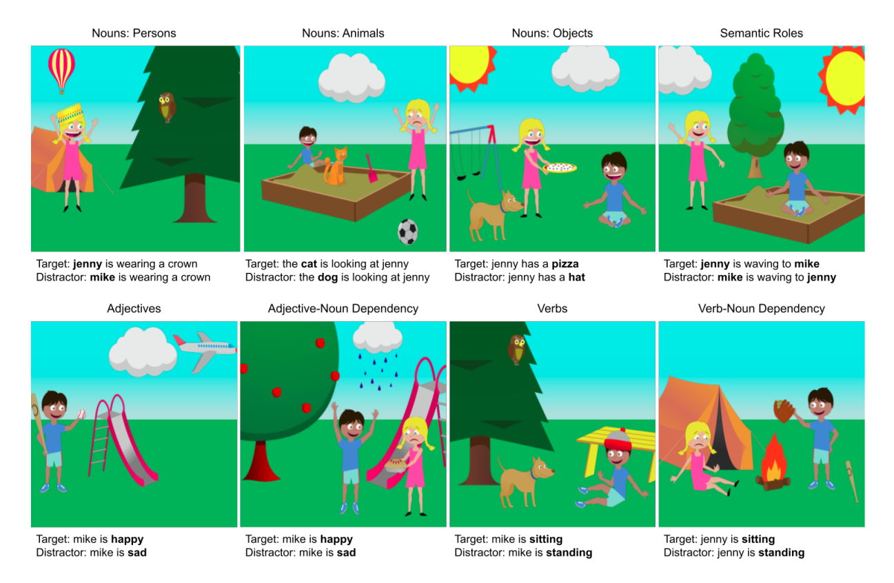
Figure 2: Examples for the evaluation of word and sentence-level semantics. Each test trial consists of an image, a target and a distractor sentence.

focused on mood-related adjectives. In addition, as there is no clear one-to-one mapping between each adjective and a facial expression, we only test the broad opposition between rather positive mood (smiling or laughing face) and rather negative mood (all other facial expressions). The resulting set of pairings was: ("happy", "sad"), ("happy", "angry"), ("happy", "upset"), ("happy", "scared"), ("happy", "mad"), ("happy", "afraid"), ("happy", "surprised").