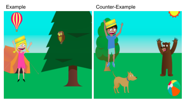
Target: jenny is wearing a crown Distractor: mike is wearing a crown

Target: mike is wearing a crown Distractor: jenny is wearing a crown