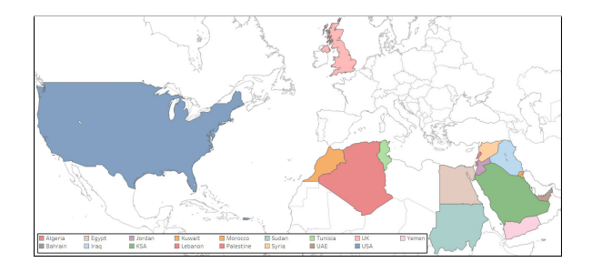
Figure 2: Geographical distribution of AraNews.

In order to study misinformation in Arabic news, we develop, AraNews , a large-scale, multitopic, and multi-country Arabic news dataset. To create the dataset, we start by manually collecting a list of 50 newspapers belonging to 15 Arab countries, the United States of America (USA), and the United Kingdom (UK). Then, we scrape the news articles from this list of newspapers. Ultimately, we collected a total of 5, 187, 957 news articles. The map in Figure 2 shows the geographic distribution of AraNews.