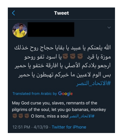
Figure 2: Example for a hate speech tweet.

Hate speech is one of the most common forms of offensive language. A text that is targeted towards a group of people-with the intent to cause harm, violence, or social chaos is known as hate speech (Derczynski, 2019). Davidson et al. (2017) define hate speech as "a language that is used to express hatred towards a targeted group or is intended to be derogatory, to humiliate, or to insult the members of the group" (p.1). Figure 2 illustrates an example of a hate speech tweet.