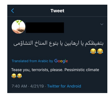
Figure 1: Example for an offensive tweet.

Text that contains some form of abusive behavior, exhibiting actions with the intention of harming others, is known as offensive language. This abusive behavior could lead to disturbances, disrespect, harm, insults, and anger, thus affecting the harmony of conversations. Wiedemann et al. (2018) describe offensive language as "threats and discrimination against people, swear words or blunt insults" (p.1). Hate speech, aggressive content, cyberbullying, and toxic comments are all different forms of offensive content (Schmidt & Wiegand, 2017). Figure 1 shows an example of an offensive tweet.