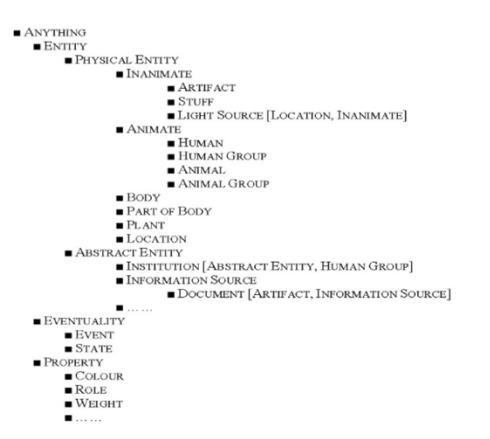
Figure 4: The top-level of the TPAS system (Ježek 2019)

Artifactual Types are those usually instantiating metonymic shifts via Qualia Exploitation whereas, Complex Types can either allow for co-predication or, when only one of their senses is used, for Dot Exploitation. Since differentiating between Qualia Exploitation and Dot Exploitation is not always clear-cut, the TPAS ontology (Ježek, 2019) keeps track of all acknowledged Complex Types by treating them as cases of multiple inheritance , i.e. by anchoring them to multiple positions within the SemType hierarchical system as in Figure 4, where [Institution] inherits from both [Abstract Entity] and [Human Group].