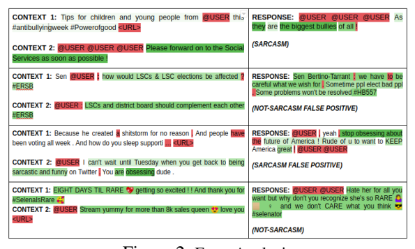
Figure 2: Error Analysis