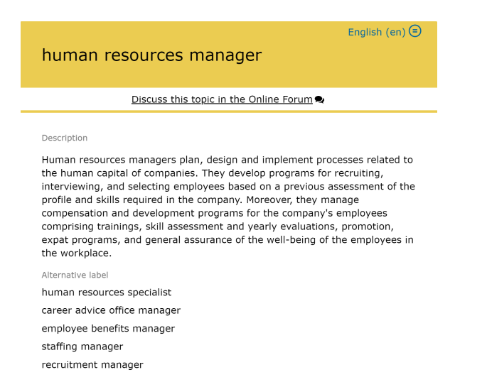
Figure 2: An example of an occupation profile from ESCO. Each occupation has a preferred and alternative labels, a description and a list of optional and essential skills, competences and knowledge.