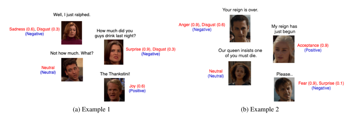
Figure 1: Examples from the MEISD dataset. Text in red represents the emotions with the corresponding intensity while text in blue represents the sentiment of the given utterance.

The major contributions of our present work are: