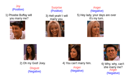
Figure 3: A dialogue from the MEISD dataset showcasing the emotion shift as the conversation grows. The text in blue represents the sentiment label while the text in red represents the emotion label of every utterance.

In Table 2, we provide the important statistics of the MEISD dataset. The average duration of an utterance in our dataset is approximately 4 seconds. The average length of an utterance in a dialogue across the training, validation and test sets are almost the same. The average dialogue length comprises of 20 utterances and it is the same across the training, validation and test splits. Every dialogue on an average consists of five emotions while the average number of emotions in a given utterance is 2. The presence of multiple speakers and the emotion shift of a speaker makes the task of emotion and sentiment analysis very interesting as well as challenging. In Figure 3, we show the emotion shift of a speaker as the dialogue grows.