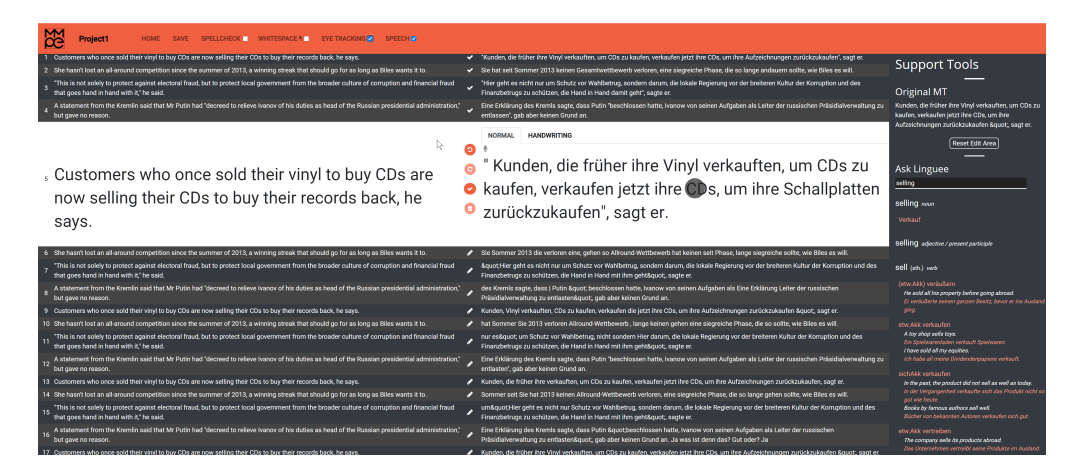
Figure 8: Eye tracking: User gazing at "CDs".

alizing the last fixation on the source and target views, thereby helping translators navigating through the text not to get lost when switching their attention back and forth between source and target. This approach is similar to GazeMarks (Kern et al., 2010), which has shown its efficiency in visual search tasks with attention shifts.