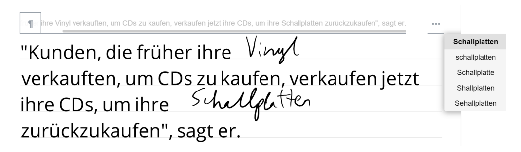
Figure 4: Hand-writing and alternatives after clicking the word "Schallplatten" in the recognized text at the top.

Furthermore, participants found the gesture to create space (drawing a vertical line at the position) often hard to accomplish, which we improved by increasing the lineheight. For the first line, we added even more space to the top, to prevent a drawing from starting in the text box containing the recognized text, where it would be ignored, thereby improving the user experience. Last, we deactivated the button of the digital pen, as it frequently resulted in unintended right-clicks triggering the context menu.