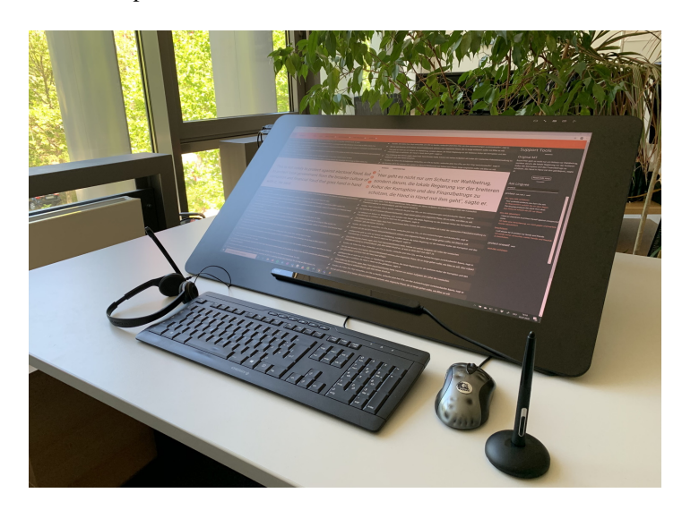
Figure 1: Hardware setup with a large tiltable screen, a digital pen, mouse, keyboard, a headset, and an eye tracker.

To optimally support the developed interactions, Herbig et al. (2020c) proposed to use a large touch and pen screen that can be tilted (see Figure 1), specifically the Wacom Cintiq Pro 32 inch display with the Flex Arm. The tilting mechanism thereby aims to better support handwriting. While this setup is rather expensive (ca. 3500 Euro), the web-based application could be used on any cheaper touch and pen device, as the usage of Bootstrap<sup>4</sup> supports layouts on different resolutions. However, one should make sure that the display is large and reacts quickly to handwritten input.