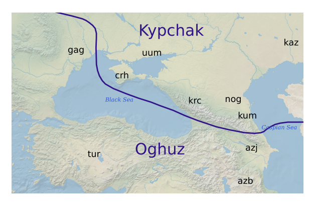
Figure 1: Location of Turkish (tur) and Crimean Tatar (crh) within the Black Sea area.

Turkish is the official language in Turkey, and an official language in Cyprus. It is a recognized minority language in Greece, Iraq, Kosovo, Macedonia and Romania. There are around 80 million fluent speakers of Turksih, mostly living in Turkey (Eberhard et al., 2019). Crimean Tatar is a recognized minority language in Ukraine and Romania. There are over half a million speakers of Crimean Tatar, who mostly live in the Crimean peninsula, Uzbekistan, Turkey, Romania, and Bulgaria (Eberhard et al., 2019). The map in Figure 1 shows the two languages' situation among other Turkic languages spoken around the Black Sea.