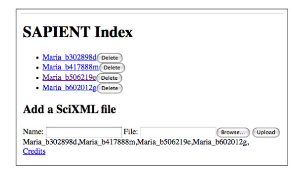
Figure 2: Index page of the SAPIENT System

each sentence. The user can perform annotations by selecting items from the drop-downs and all the corresponding annotation information is stored in Javascript until a request to save is made by the user.