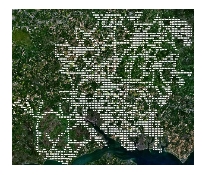
Figure 2: Road Ice Model Data Points Map

1. The input data has to be analysed, this is non-