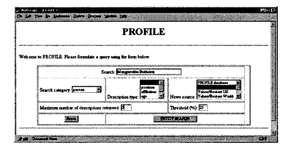
Figure 7: Web-based interface to PROFILE.

tion, nationality) as well as the maximal number of queries that they want. They can also specify which sources of news should be searched. Currently, the system has an interface to Reuters at www.yahoo.com, The CNN Web site, and to all local news delivered via NNTP to our local news domain.