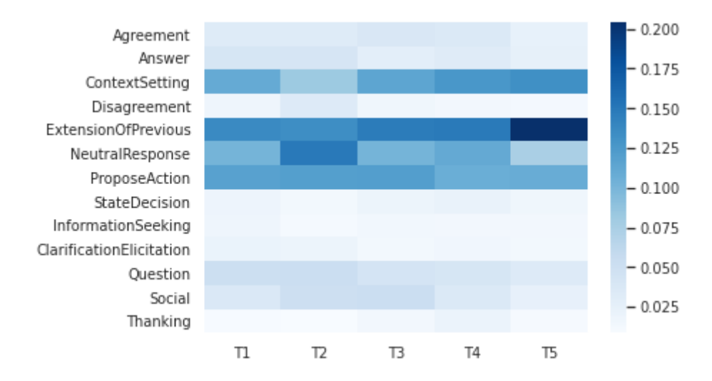
Figure 1: DA distribution across time. Each column is a DA distribution in a particular time period of the draft life-cycle. Colors convey the probability mass assigned to a DA in emails from that period.