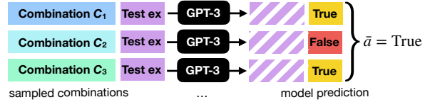
Figure 2: Silver labeling of unlabeled test example given several sampled combinations. This example is for a binary task with True or False labels (e.g., StrategyQA).

We now use the accuracy against the silver label as a surrogate objective \mathcal{O} , searching for C that maximizes accuracy with respect to the \hat{a} :