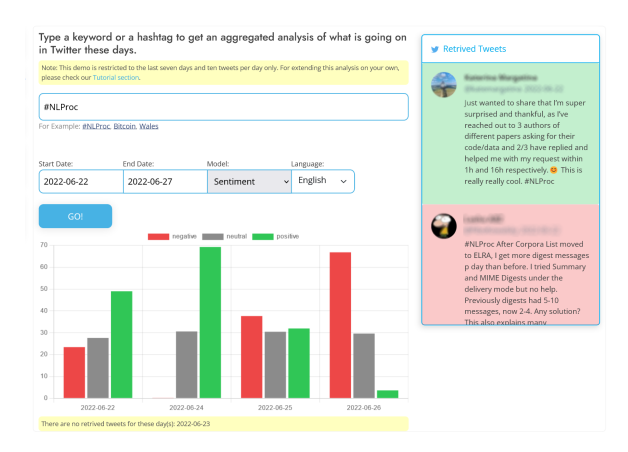
Figure 2: TweetNLP hashtag analysis demo. The output is a bar plot that shows the sentiment of the retrieved tweets over time for the input hashtag #NLProc.

Hashtag analysis (Figure 2). This demo directly interacts with the Twitter API. Users can type a hashtag (or any keyword), initial and end dates, task and language. The system will then retrieve tweets for the given time interval and compute an aggregated analysis of the results. Languages supported for this demo are available in the appendix.