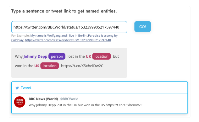
Figure 5: TweetNLP Named Entity Recognition demo.

Default TweetNLP language models. While in TweetNLP all Twitter-specific language models are included, we use as a default (1) TimeLMs trained until December 2021 for English and (2) XLM-T for the languages other than English and multilingual tasks. These models are then fine-tuned to the corresponding tasks as described in Section 3.2.