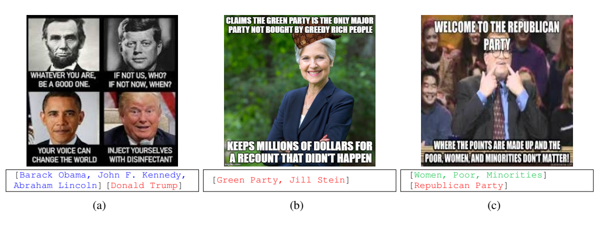
Figure 1: Examples of heroes, villains and victims, as portrayed within memes.

While some previous meme studies have sought to identify harmfulness and the entities (Sharma et al., 2022a) or the categories that are being targeted, e.g., a person, a group, an organization, or society (Pramanick et al., 2021a,b), none of them has scrutinized the entity's connotation. Our shared task aims to bridge this gap. We release HVVMemes, a meme dataset with about 7,000 memes on COVID-19 and US Politics, where each meme is annotated with a list of entities, each labeled with its role: hero, villain, victim, or other. The shared task attracted 105 teams, and nine of them made official submissions. Most teams finetuned pre-trained language and multimodal models or used ensembles, with the best system achieving an F1-score of 58.67. We discuss the submissions and their approaches in more detail in Section 5.