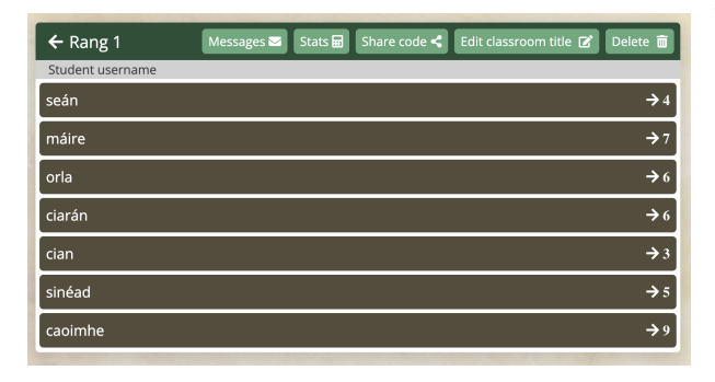
Figure 4: The classroom dashboard as seen by teacher accounts.

• Each classroom has an associated code with which students can join.