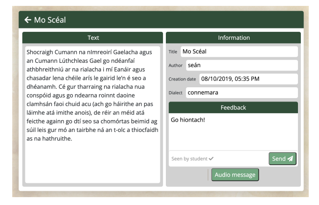
Figure 5: Teachers can directly access their students' stories, where they can leave textual and audio feedback.