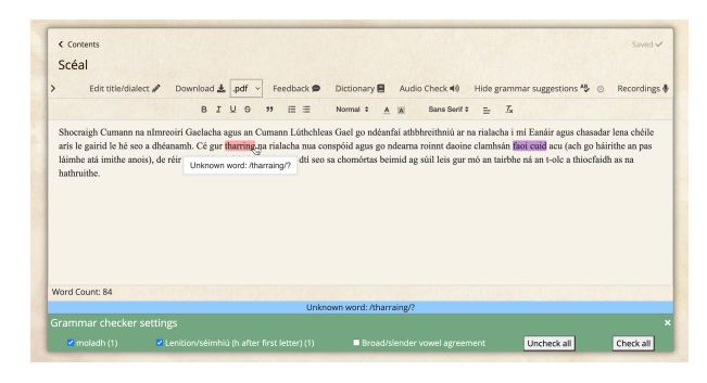
Figure 2: Central student dashboard, with grammar-checking toggled on.

resolve it. Students may filter which kinds of errors are flagged using a series of check-boxes below the editor, see Figure 2.