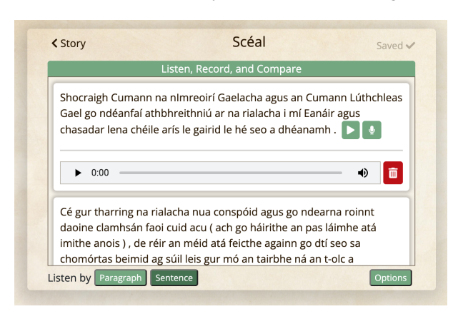
Figure 3: Students may synthesise their stories, and compare recordings of their own speech.

Given a unique code, a student may join their teacher's classroom, enabling the teacher to view their stories and provide textual or audio feedback.