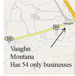
Figure 4: Geo-centric area near Vaughn, Montana

coordinates so that those that have fewer than that number of businesses different between their search radii end up sharing a single LM.