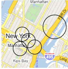
Figure 3: Geo-centric areas in New York City

is computationally infeasible to either pre-compute geo-centric LMs for each uniquely identifiable set of geo-coordinates in the USA, or to compute them on-the-fly for large numbers of users. Fortunately, the number of business geo-coordinates in the USA is much sparser than the number of possible user geo-coordinates. There are about 17 million name-address unique businesses in the USA; assuming 8-digit geo-code accuracy they are located at about 8.5 million unique geo-coordinates 3 . So we build LMs for business geo-coordinates rather than user geo-coordinates, and at run-time we map a user's geo-coordinates to those of their closest business.