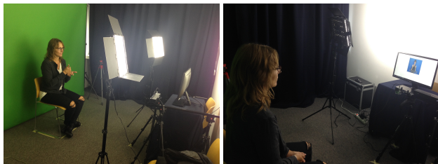
Figure 2: Recording setting.