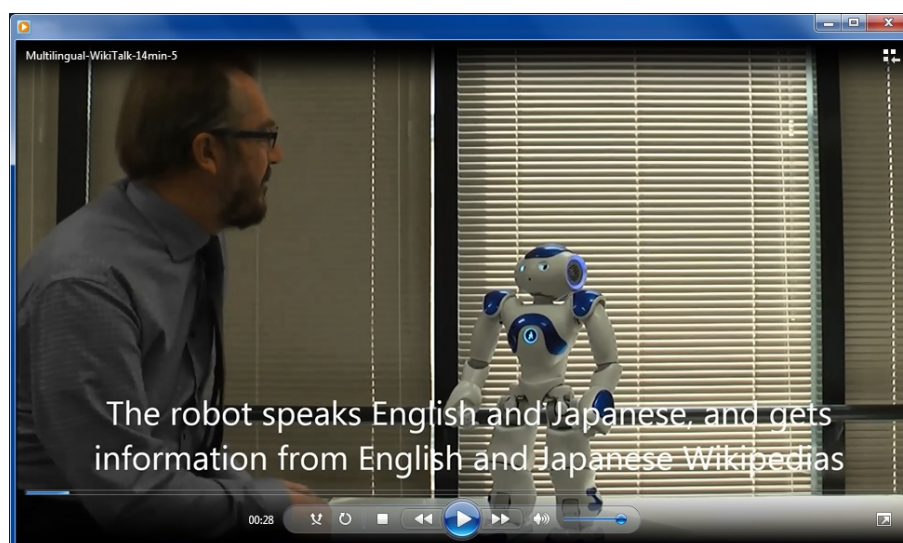
Figure 3: Annotated video of an English-Japanese language-switching robot ( https://drive.google.com/open?id=0B-D1kVqPm1KdRD1kVHh4Z2tUTG8 ).

The video in Figure 3 shows information access dialogues with English and Japanese WikiTalk, using a bilingual Nao robot that switches language on demand. This video was shown at SIGDIAL 2015 and is described by Wilcock and Jokinen (2015).