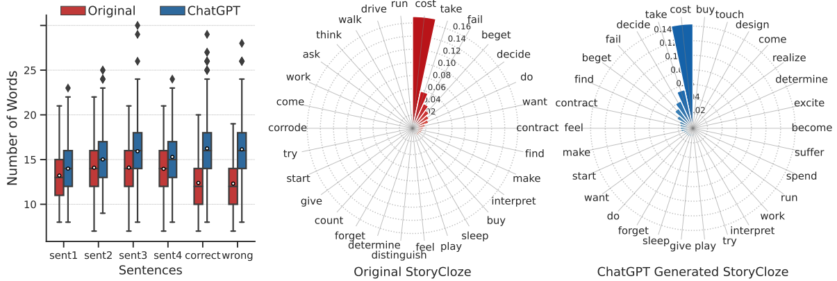
Figure 2: Comparison between the 30 most frequent events and the lengths of the sentences in the original and the ChatGPT-generated English StoryClope dataset.