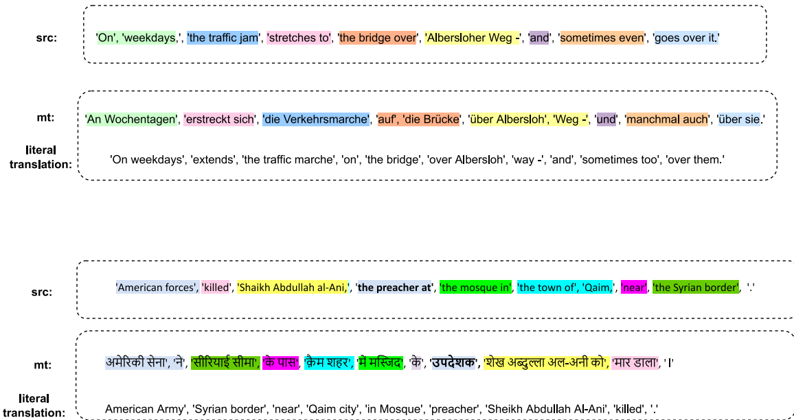
Figure 1: Illustration of chunk similarity for two example sentences (en-de & en-hi).

evaluates a machine translated output based on the corresponding source sentence regardless of the reference. Figure 2 depicts the high-level architecture of our model. The chunks of source and hypothesis are acquired from the multilingual chunking model. Further chunk-wise subword contextual BERT embeddings are mean-pooled to obtain the chunk-level embeddings. Meanwhile, LaBSE model (Feng et al., 2020) is used for the sentence-level embeddings. Using these embeddings, we compute chunk-level similarity and sentence-level similarity, finally combine them by averaging chunk- and sentence-level similarity scores 1 . We discuss the working details of our system in the following sections.