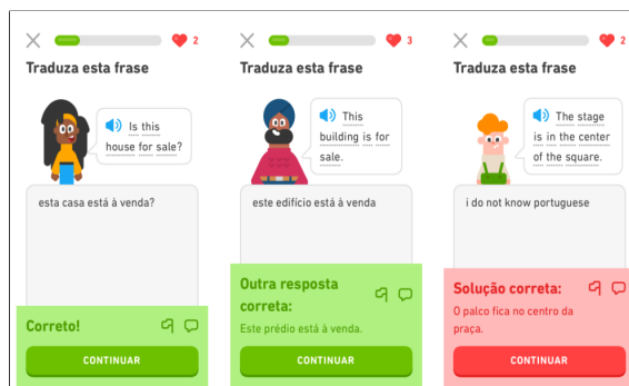
Figure 1: Translations proposed by English language learners at various levels of fluency, from diverse backgrounds. Our multi-checkpoint ensemble models mimic learner fluency. 4

The main set up of the 2020 Duolingo Shared Task on Simultaneous Translation And Paraphrase for Language Education (STAPLE 2020) (Mayhew et al., 2020) is such that one starts with a set of English sentences (prompts) and then generates high-coverage sets of plausible translations in the five