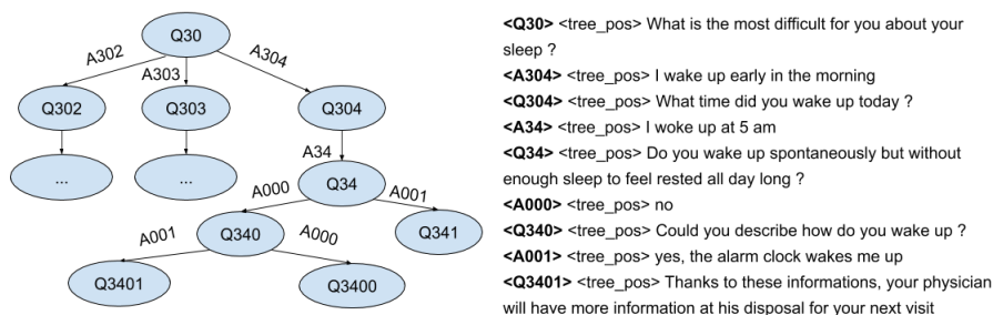
Figure 1: Fragment of dialog tree for the sleep domain and a corresponding dialog

Collecting an Initial Corpus from an Expert. Studies have shown that the closed questionnaires traditionally used in the context of clinical studies are ineffective in gathering correct and precise information about the patient status because the patients get used to the questions and routinely input the same answers from one interaction to the next. Our long-term goal is to develop a Human-Machine dialog system that would complement standard clinical questionnaires by regularly engaging the patient in a dialog about the questionnaire topics. Since our target users are chronic pain patients, it is more important to keep them engaged for a long period rather than getting all information at the first interaction. To create our dialog corpus, we asked a physician to formalize typical patient-doctor interactions occurring in the context of a clinical study in the form of a dialog tree describing which questions need to be asked and for each question, which answers are possible. The interactions cover four domains namely, sleep, mood, anxiety and leisure activities and the dialog tree has 58 nodes. A fragment of the dialog tree created for the sleep domain is shown in Figure 1 on the left and an example dialog for the SLEEP domain in the same figure on the right. We call the data collected from the expert D_{init} .