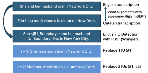
Figure 1: Our code-switching data generation pipeline with an example of English and Catalan parallel corpora.

Our contributions are summarized as follows: We (1) apply a single synthetic data generation method to different language pairs, including low-resource languages such as Tamil, based on a single dataset and thereby eliminate differences that emerge from the discrepancies in data generation methodology, (2) release a new code-switching dataset, CoVoSwitch, with similar code-switching levels across 13 languages, and (3) compare trans-