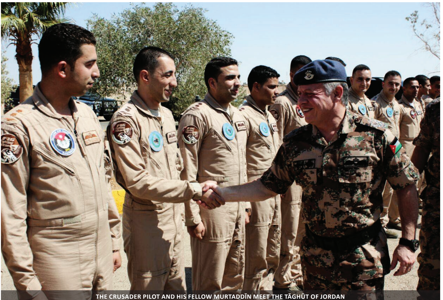
THE CRUSADER PILOT AND HIS FELLOW MURTADDĪN MEET THE TĀGHŪT OF JORDAN