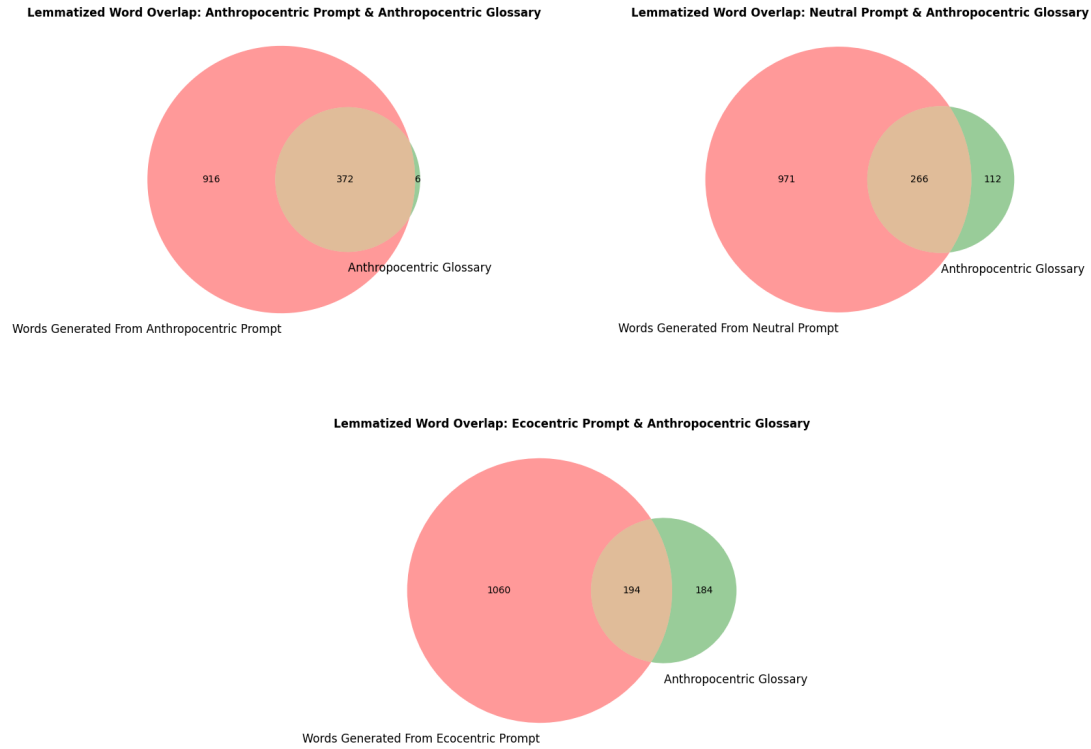
Figure 1: Venn diagrams showing the intersection of Anthropocentric terms within the three output categories. The red set represent of words generated from the three prompt categories (Anthropocentric, Neutral, and Ecocentric), the green set the Anthropocentric glossary words, and the yellow set contains the overlapping words between the two.

as ecologically positive or negative. Ecologically "positive" verbs, such as protect , sustain , respect , and thrive , dominate ecocentric outputs, aligning with nature-centered perspectives. In contrast, anthropocentric outputs emphasize "negative" verbs, such as breed , domesticate , and serve , reflecting human-centered control or exploitation of non-human entities. Neutral prompts display a mixed distribution of positive and negative verbs. While verbs like protect and sustain appear, their lower frequency compared to ecocentric outputs suggests weaker ecological framing. Meanwhile, the frequent occurrence of domesticate and serve reveals an implicit anthropocentric bias, indicating that the model's neutral responses often default to human-centered language patterns.