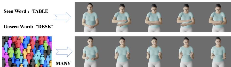
Figure 1: Top row: given a text word in dataset, wSignGen can generate a 3D signing avatar corresponding to that word. Also, wSignGen supports unseen but semantically close words. Bottom row: given a semantically meaningful image, the closest associated word is identified via CLIP and wSignGen generates the corresponding sign.

Our contributions are threefold: First, we introduce a novel approach for word-conditioned 3D ASL motion generation, synthesizing more accurate, realistic, and expressive sign language motions. Second, we present wSignGen, a model that combines CLIP with a diffusion-based approach using a classifier-free strategy, offering two advantages: image-based generation and the ability to generalize to unseen synonyms. Third, extensive experiments show that wSignGen consistently outperforms baseline models on standard generative metrics and receives highly positive feedback from human evaluators.