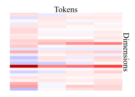
Figure 2: A heatmap of contribution scores in word vector space over a sequence of tokens. Red means positive contribution (score > 0), blue means negative contribution (score < 0).

have contributed for a given example to produce a decision (e.g. classification or regression)."<sup>1</sup> In our case the interpretable domain is the plain text space. There exist several candidate explainability methods, one of which we present in the following as an example.