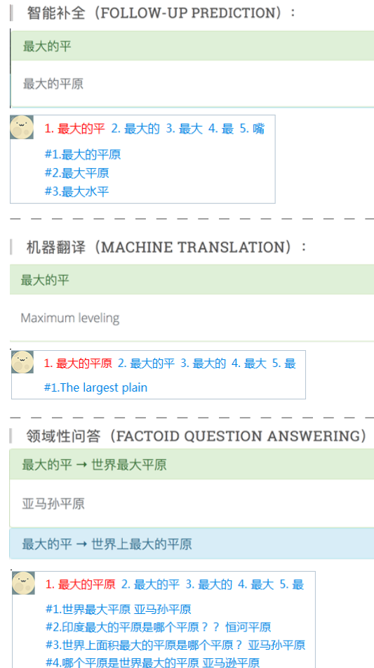
Figure 2: A case study of Association Cloud Platform.

Figure 2 shows a typical result returned by the platform when a user gives incomplete input. When user input pinyin sequence such as “zui da de ping”, the P2C module returns “最大的平” as one candidate of the generated list and sends it to association platform. Then associative prediction is given according to the input mode that user current selections. Since the demands of the users are quite diverse, our platform to support such demands can be adapted to any specific domains with complex specialized terms. We provide a