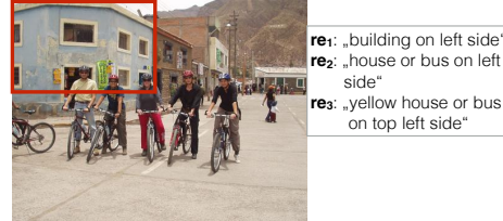
(c) Start with Location, Object Type, Other :