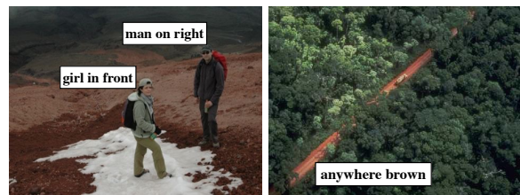
Figure 1: Example images and REs from the ReferIt corpus (Kazemzadeh et al., 2014)

A speaker who wants to refer to an object in a visual scene will try to produce a referring expression (RE) that (i) is semantically adequate, i.e. accurately describes the visual properties of the target referent, and (ii) is pragmatically and contextually appropriate, i.e. distinguishes the target from