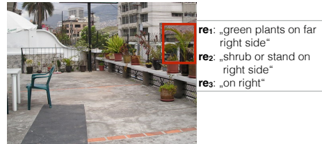
Figure 3: Examples for context-dependent installments

the pattern-based installment (Section 4.2) and the context-dependent installment strategy (Section 4.3). In this evaluation, we only use word classifiers trained on GoogLeNet features.