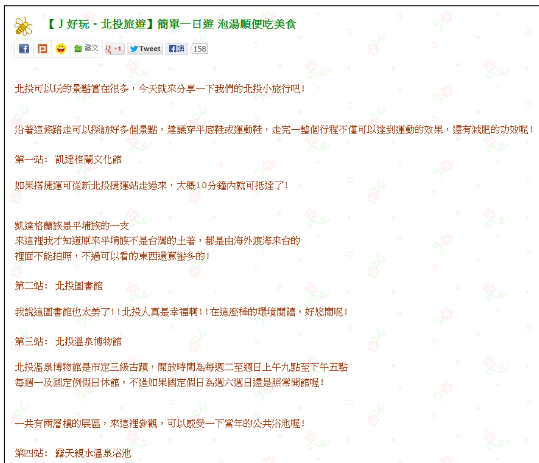
Figure 3. Consecutive itineraries in a travel blog