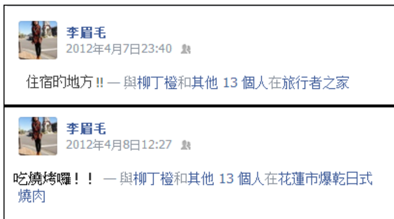
Figure 2. A consecutive itinerary of Check-in data

the large collection of mobile users' check-in data, and then utilize these interesting itineraries for recommendation of next location and activity for mobile users. In this work, we thus simply define any two sequential check-ins of each user as a consecutive itinerary in advance, and show an example of a consecutive itinerary in Figure 2.