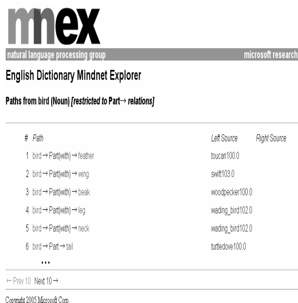
Figure 2: MNEX output for “bird (Noun) Part” query

user enters. A path is a set of links that connect one word to another within either a single semrel structure or by combining fragments from multiple semrel structures. Paths are weighted for comparison (Richardson, 1997). Currently, either one or two words can be specified and we allow some restrictions to refine the path search. A user can restrict the intended part of speech of the words entered, and/or the user can restrict the paths to include only the specified relation. When two words are provided, the UI returns a list of the highest ranked paths between those two words. When only one word is given, then all paths from that word are ranked and displayed. Figure 2 shows the MNEX interface, and a query requesting all paths from the word bird , restricted to Noun part of speech, through the Part relation: