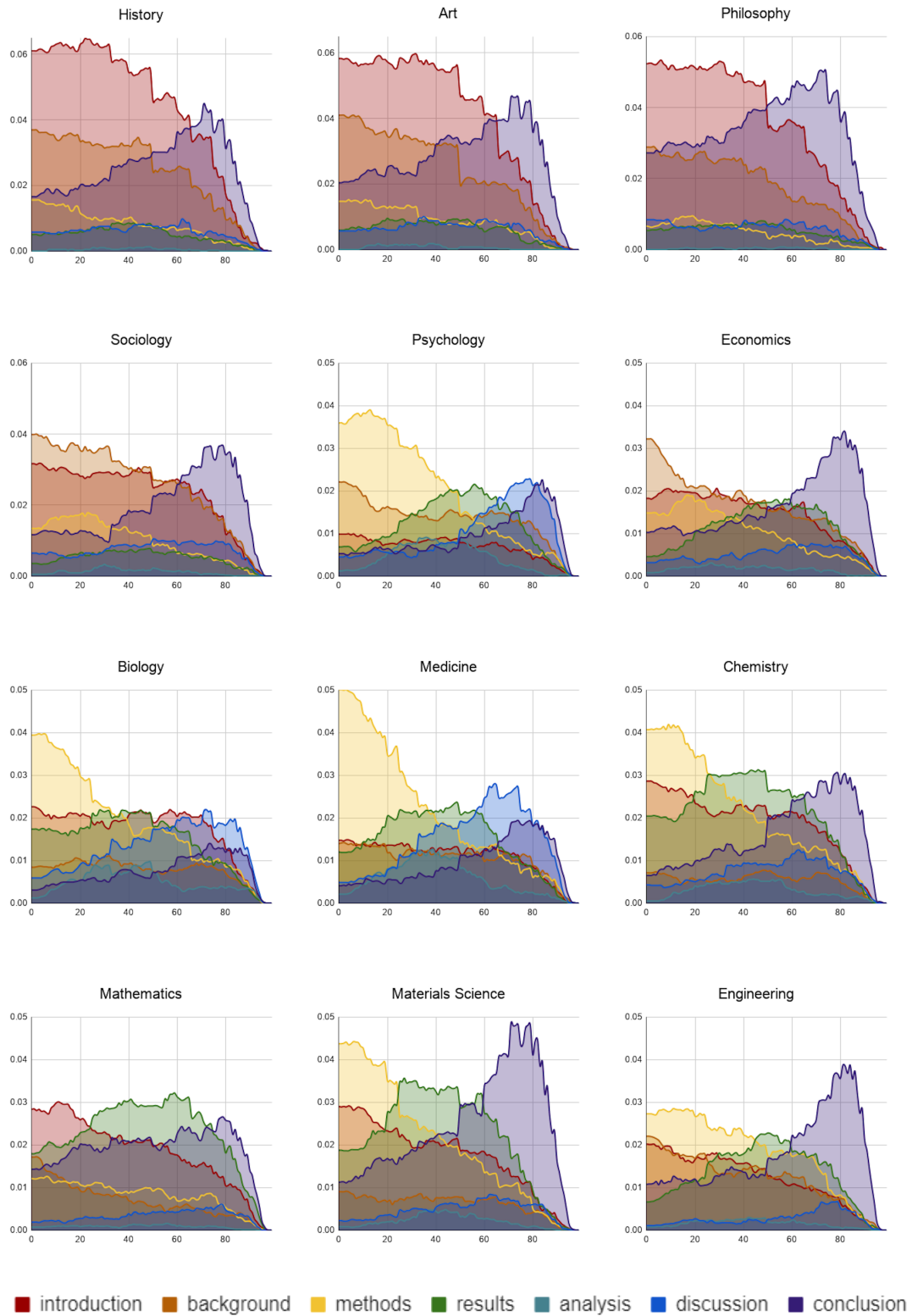
Figure 3: Aggregate Frequency for 12 of the 19 disciplines