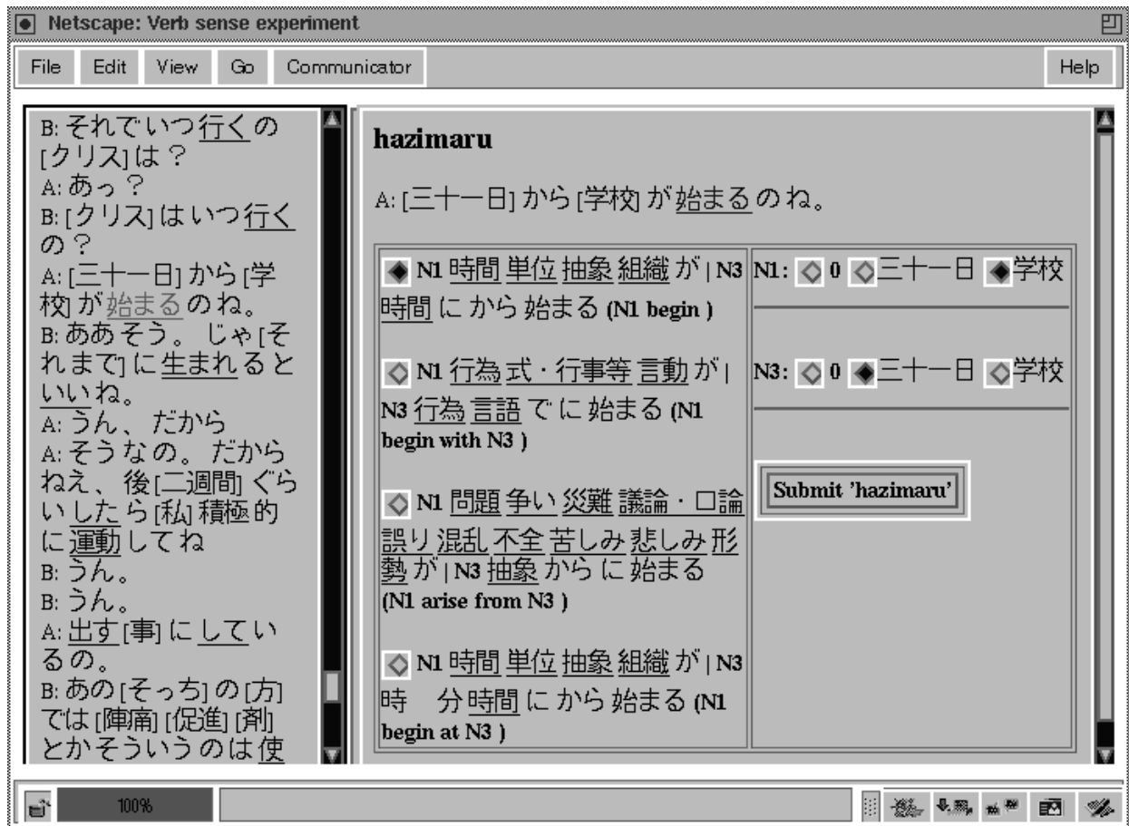
Figure 5: Screen shot of verb sense diambiguation application

The left frame of the application displays the transcript of a CHJ conversation. NPs in the transcript are enclosed in square brackets, and main verbs are underlined and hyperlinked. Clicking on a main verb in the transcript (left frame) brings up a verb sense menu for that verb in the right frame.