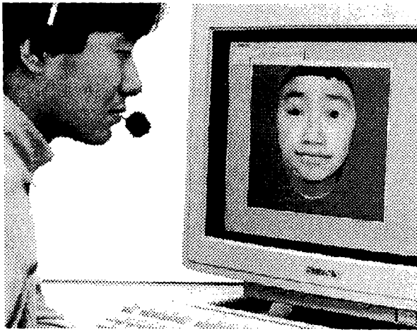
Figure 2: Dialogue Snapshot

the system incorporates 16 muscles and 10 parameters, controlling mouth opening, jaw rotation, eye movement, eyelid opening, and head orientation. These 16 muscles were determined by Waters, considering the correspondence with action units in the Facial Action Coding System (FACS) [Ekman and Friesen, 1978]. For details of the facial modeling and animation system, see [Takeuchi and Franks, 1992].