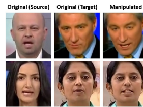
Figure 3: Example from the FaceForensic video manipulation dataset ( Rössler et al., 2018 ) showing the manipulation generation approach.