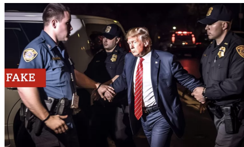
Figure 1: Manipulated image depicting arrest of former US president Donald Trump.

In AFC, the term multimodal has been used to refer to cases where the claim and/or evidence are expressed through different or multiple modalities (Hameleers et al., 2020; Alam et al., 2022; Biamby et al., 2022). Examples of multimodal misinformation include: (i) claims about digitally manipulated content (Agarwal et al., 2019; Rössler et al., 2018) such as photos depicting former US president Trump’s arrest (Figure 1); (ii) combining