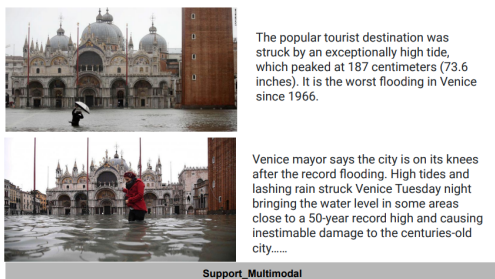
Figure 5: An entry from the Factify dataset (Suryavardan et al., 2023b) depicting an image/text claim and supporting image/text evidence document.