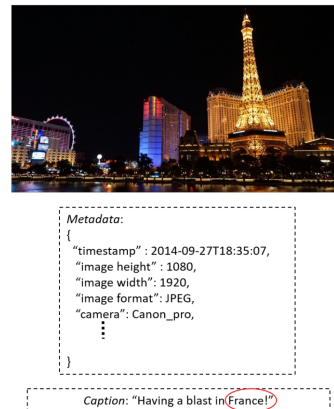
Figure 4: An entry from the MAIM dataset ( Jaiswal et al., 2017 ) showing an image/text claim with metadata.

We manually screened and filtered the papers based on abstracts and introduction sections, before creating an overview of papers across the following dimensions: (1) modality; (2) fact-checking task; (3) contribution type (i.e. dataset, modeling approach, demo); (4) paper type (i.e. survey, position paper, solution paper (e.g. introducing a new benchmark or modeling approach), or evaluation paper (e.g. investigating previously proposed approaches)). Papers were mostly excluded because they focused on other tasks than fact-checking (e.g. hate speech detection) or used modalities out of our scope (e.g. tables). Moreover, during the screening process we found and added further related works, and concluded the screening with 84 unique papers.