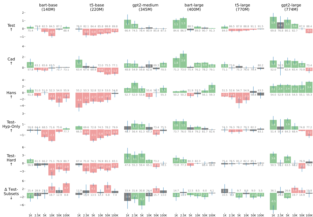
Figure 1: Effect of self-rationalization for NLI across six models (columns) and varying amounts of training data (x axis). Bar heights show mean differences between baseline task-only models and self-rationalization models for: task performance (row 1), performance on manually annotated challenge datasets (rows 2-3), performance on hard subsets of original SNLI evaluation data (rows 4-5), and \Delta TEST-SUBSETS (row 6). Baseline values are shown in gray. Error bars indicate standard errors of the means. Green/red bars indicate improvement/degradation in robustness; gray bars indicate error bars intersecting 0.

HYP , a subset of the SNLI test set for which a hypothesis-only classifier was found to give incorrect predictions (Gururangan et al., 2018). 11