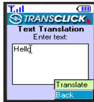
Figure 2. Text Translation Interface

Testers also reported little trouble with keypad manipulation when following the User Manual closely.