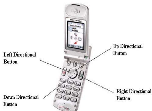
Figure 4. Scrolling and the “Mouse”

There was some additional concern among all three testers that the green “start” button, a feature provided by most cellular phone hardware makers, was a more natural choice as the “select” button. Testers did not mention the same issue confusing the red “end” button with the “back” button on the top right, however.