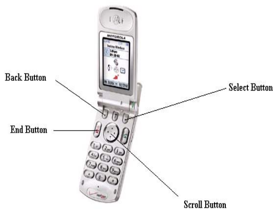
Figure 3. Motorola Web Phone

One of the most frequently used actions, scrolling, is found on the “mouse”. Task selection, equally important, is found on the uppermost key, simply called the “select button”. Pressing this key will select an activity highlighted by the scrolling action. Testers found the mouse easy to manipulate, and physically easier to manipulate than the keypad. Some testers expressed a preference for both scrolling and selecting on the mouse.