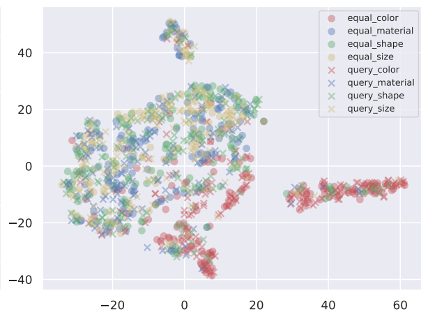
Figure 2: Analysis of the neuron activations on the penultimate hidden layer of the model trained independently on Y/N-q.