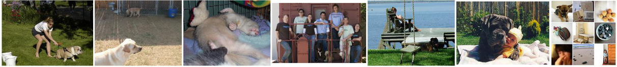
Figure 2: Examples of dog in the ESP Game dataset.