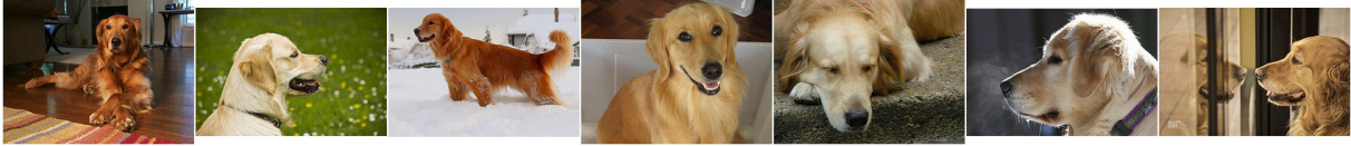
Figure 3: Examples of golden retriever in ImageNet.