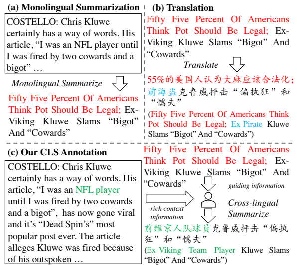
Figure 1: An En-Zh summary from Wang et al. (2022a) (best viewed in color). We compare “pipeline: (a)→(b)” annotation protocol and our annotation (c) protocol. Pipeline annotation results in errors from both summarization (red: unmentioned content/hallucination) and translation (cyan: incorrect translation) processes. To address this issue, we explicitly annotate target-language summaries with faithfulness rectification (green) based on input context, with the guidance of mono-lingual summaries.

With the advance in deep learning and pre-trained language models (PLMs) (Devlin et al., 2019; Lewis et al., 2020; Raffel et al., 2020), much recent progress has been made in text summarization (Liu and Lapata, 2019; Zhong et al., 2022a; Chen et al., 2022a). However, most work focuses on English (En) data (Zhong et al., 2021; Gliwa et al., 2019; Chen et al., 2021), which does not consider cross-lingual sources for summarization (Wang et al., 2022b). To address this limitation, cross-lingual summarization (CLS) aims to generate summaries in a target language given texts from a source language (Zhu et al., 2019), which has shown values