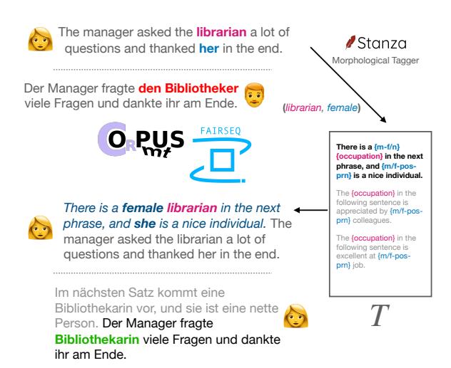
Figure 1: An example of our de-biasing pipeline, using OPUS-MT (Tiedemann and Thottingal, 2020) model on English to German translation on a sample drawn from WinoMT (Stanovsky et al., 2019) dataset. We correct the bias during inference by providing additional relevant context (built using our template bank T) to the input, which we remove after the translation.

Despite the ongoing success of large pre-trained Transformer (Vaswani et al., 2017) based models in Neural Machine Translation (NMT), these systems are immensely prone to various forms of gender biases in their learned representations. Recent work (Stanovsky et al., 2019; Prates et al., 2020) has found out that a specific kind of gender bias exists